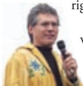
AFN National Chief, 2002

Matthew led the Cree fights concerning the Great Whale Hydro-electric Project and our right of self-determination in the context of Quebec separation. Nationally, he has led First Nations' struggles and negotiations right across the country.