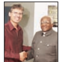
Anti-apartheid leader and Nobel Peace Prize winner Bishop Desmond Tutu in South Africa

Now is the time for our people to unite again to once again to elect a principled, effective, experienced and courageous leader for the James Bay Cree Nation.